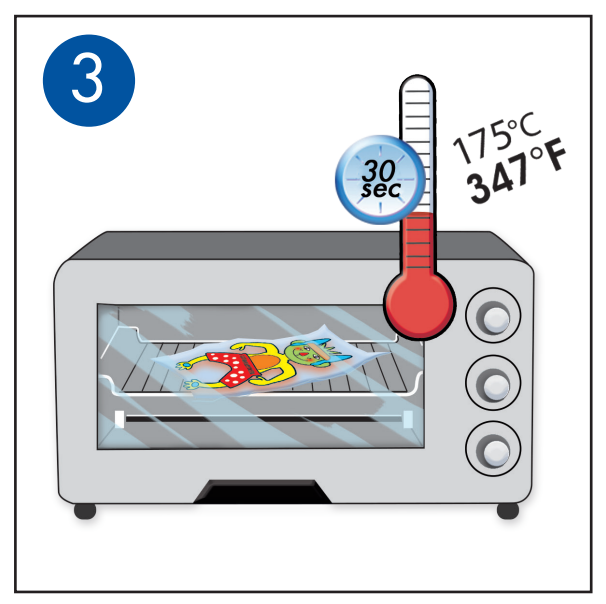
Shrink the plastic in the oven or use a craft tool