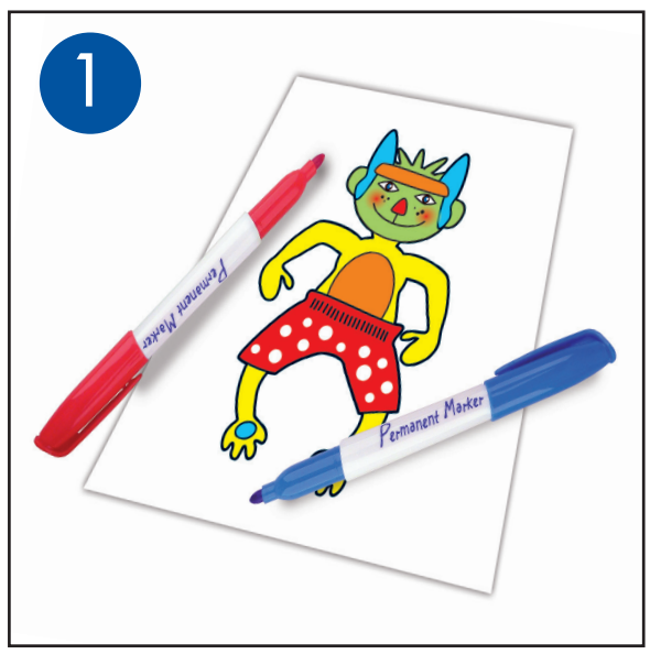
Draw with a Krimpie Permanent Marker on a Krimpie sheet. (frosted, white or transparent)